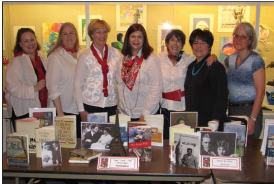
Bryant Library Reference Librarians at a "Hot off the Press" Book Discussion.